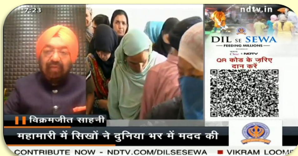
NDTV Dil Se Sewa