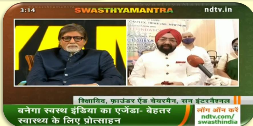
NDTV Swasth India